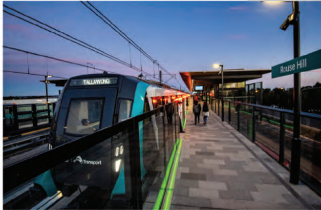
Rouse Hill & Tallawong Metro Station (2 mins)