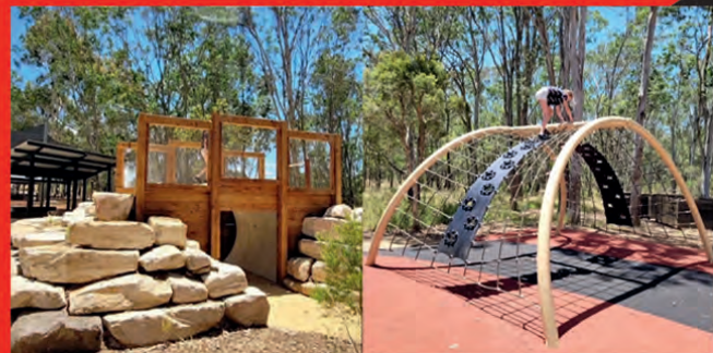
Rouse Hill Regional Park