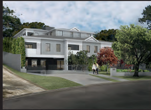
Domestic Violence emergency shelter at Penrith