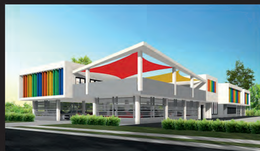
School & Childcare for Eagle Raps in Doonside