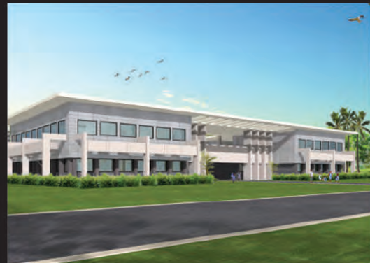
Yaadein Vision School in Nadi, Fiji