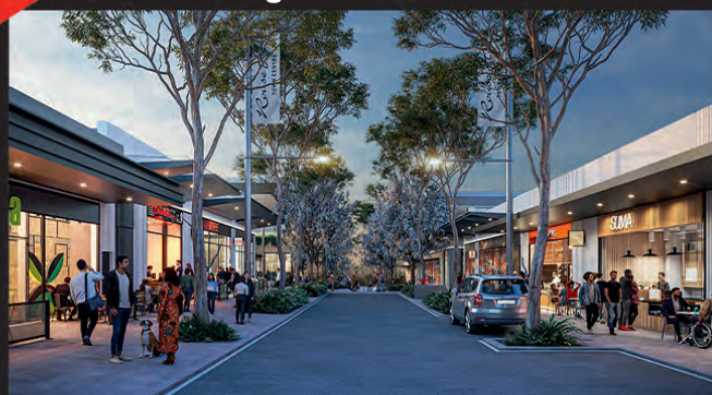
Rouse Hill Town Centre