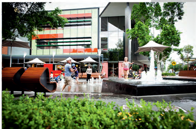
Rouse Hill Town Centre (2 mins)