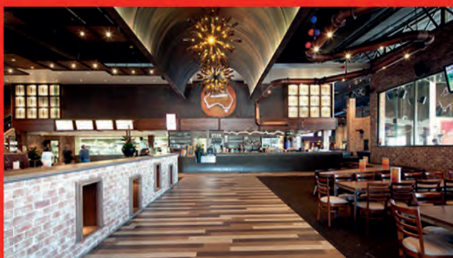
The Australian Hotel & Brewery