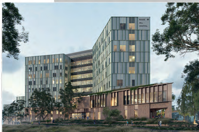
Rouse Hill Public Hospital (2 mins)