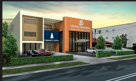
Hindu Bhavan at Parramatta