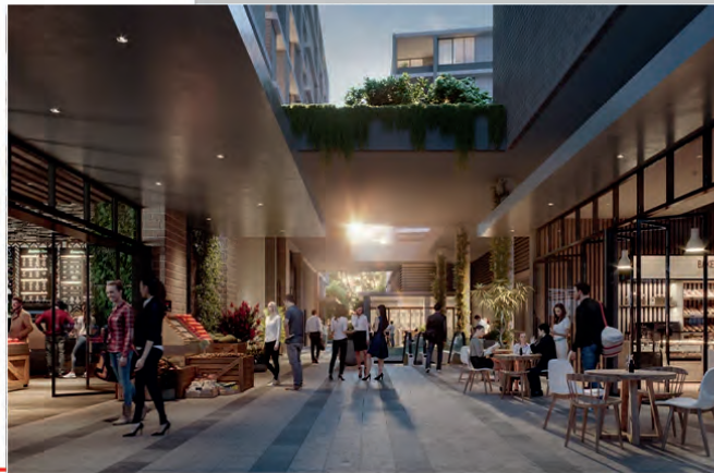
Tallawong Village Retail (2 min)